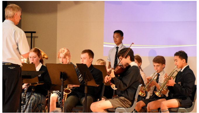
Band performing at Grandparents Day

The College hosted an afternoon showcasing the various talents of students in relation to Creative Arts, Performing Arts and Technologies (CAPATECH). Performances included dances, College band and choirs, drama and musical performances. Student's work in the Design, Art and Technology subject areas were also on display.