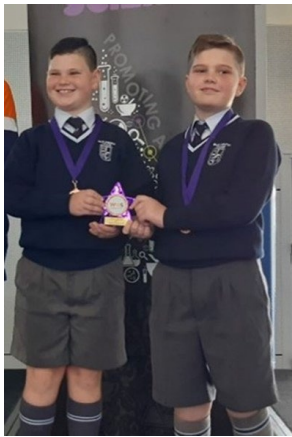
Wonder of Science winners