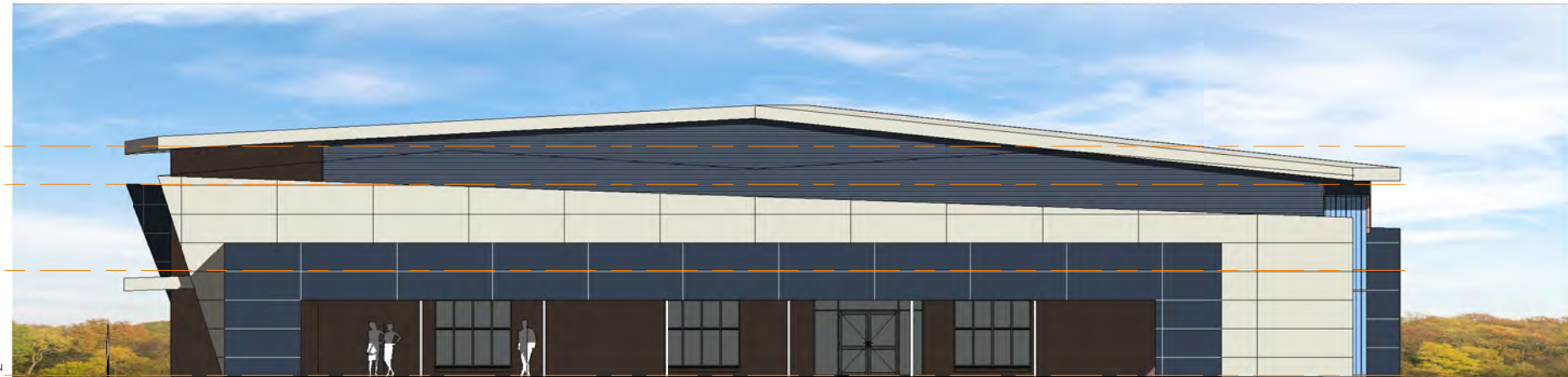
WEST ELEVATION SCALE 1 : 100

▽ 353830 PITCHING LEVEL ▽ 352630 CEILING LEVEL ▽ 349930 FIRST FLOOR LEVEL ▽ 346630 GROUND FLOOR PLAN