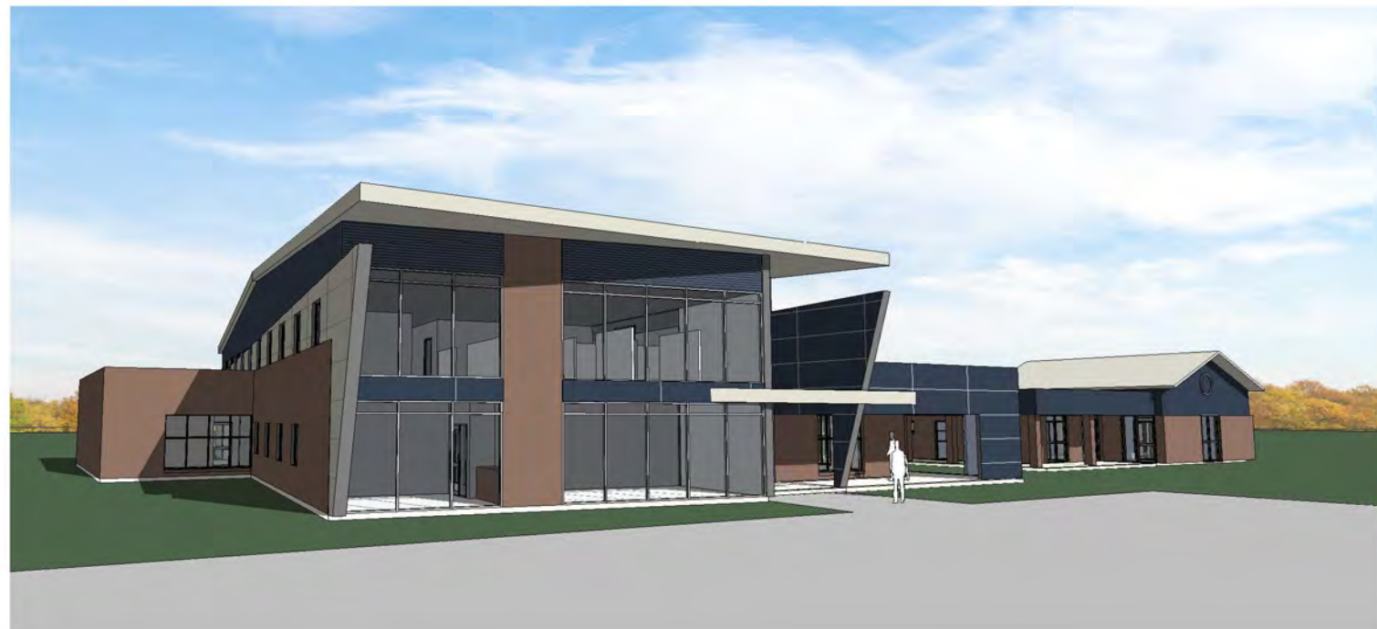
EXTERIOR PERSPECTIVE 3 SCALE