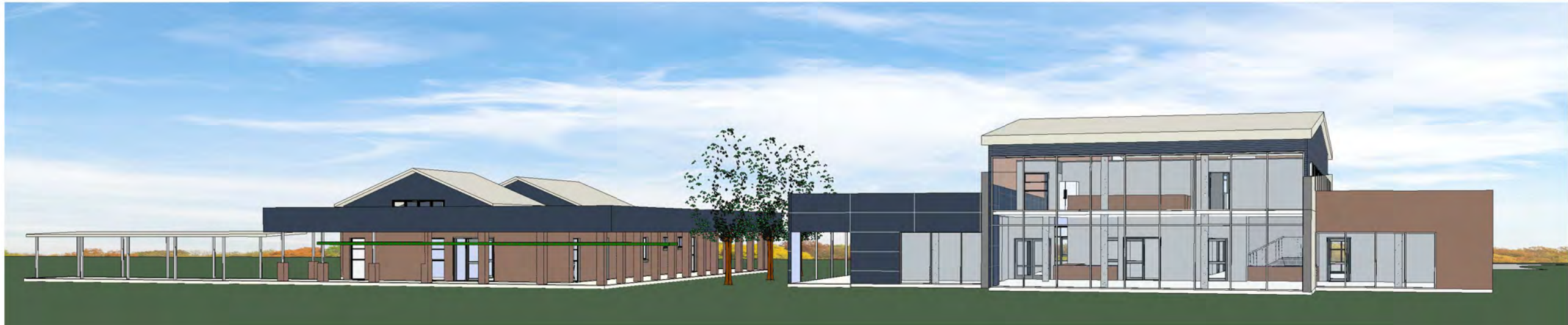
EXTERIOR PERSPECTIVE 2 SCALE