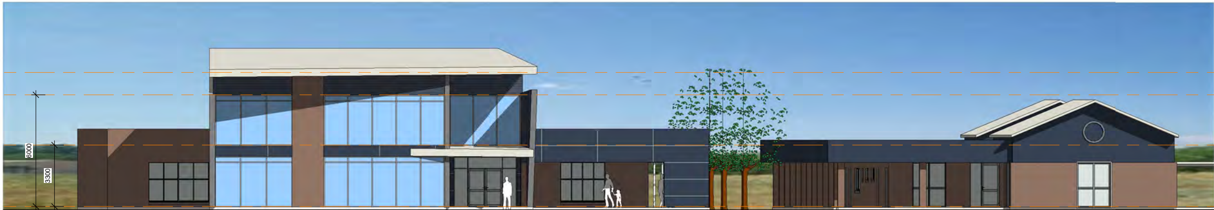
NORTH ELEVATION SCALE 1 : 100

▽ 353830 PITCHING LEVEL ▽ 352630 CEILING LEVEL ▽ 349930 FIRST FLOOR LEVEL ▽ 346630 GROUND FLOOR PLAN