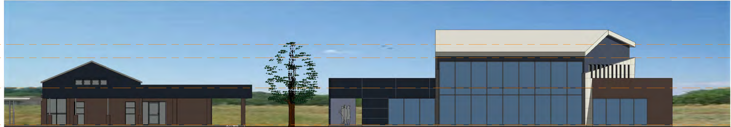
SOUTH ELEVATION SCALE 1 : 100

▽ 353830 PITCHING LEVEL ▽ 352630 CEILING LEVEL ▽ 349930 FIRST FLOOR LEVEL ▽ 346630 GROUND FLOOR PLAN