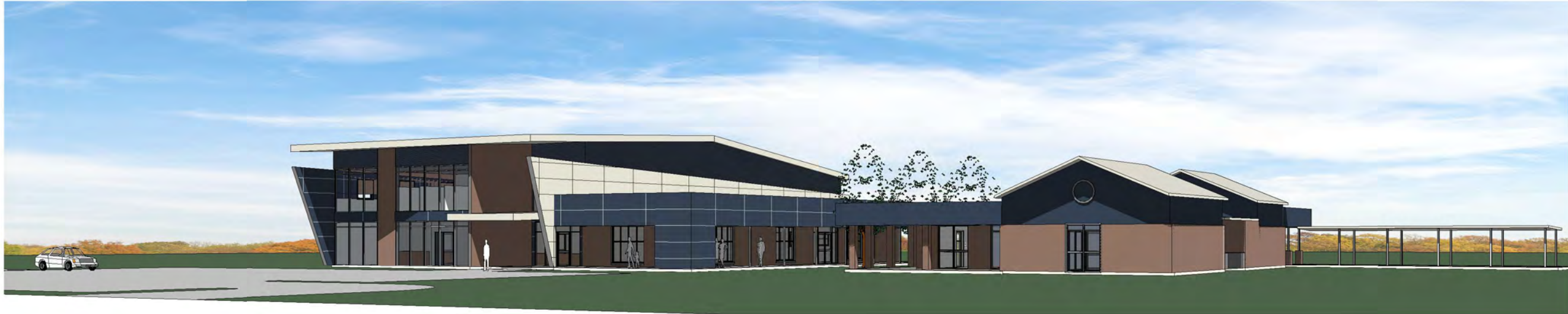
EXTERIOR PERSPECTIVE 1 SCALE